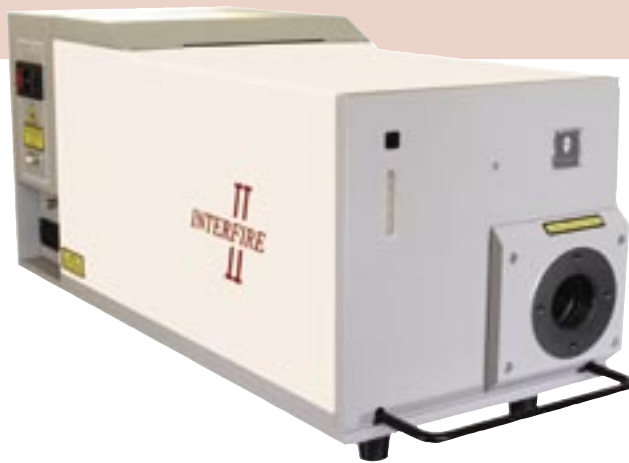
the INTERFIRE II family, 10.6 shown above and the 3-5 below.

To meet the increasing demands for the accurate optical testing of infra-red (IR) materials and lens systems, Precision-Optical Engineering has designed, developed and now manufacture the INTERFIRE II family of IR interferometers that cover the testing of systems in the Mid (3-5 micron) and Far (8-12 micron) IR wavebands . Additional interferometers can be supplied between 850nm and 1.55 microns